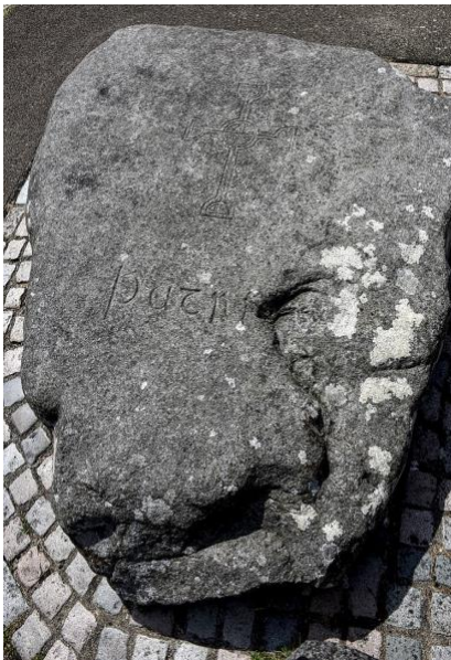
St. Patrick's grave in Downpatrick

Down is also home to an area called the Brontë Homeland, where Patrick Brontë (orig. Brunty), father of Anne, Charlotte, Emily, and Branwell Brontë, was born and raised. As the great Irish entertainer Percy French wrote, "The mountains of Mourne sweep down to the sea."